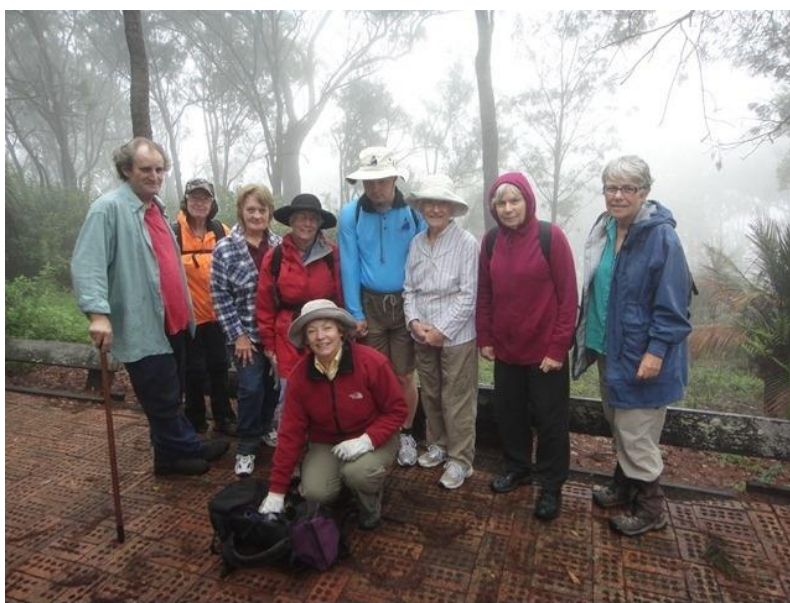
Braving the mist on Mt Archer, 11 November, 2012