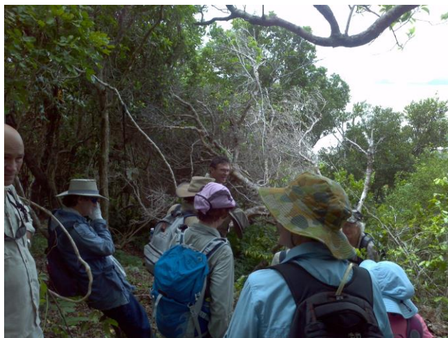
Looking out towards the Keppel Islands