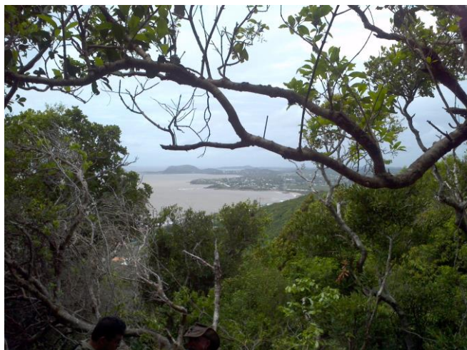
View towards Rosslyn Heads

With a bit of good luck, the moody weather disappeared for a morning, and fifteen bushwalkers enjoyed a morning's walk along a reasonably clear track in Vallis Park in the Capricorn National Park.