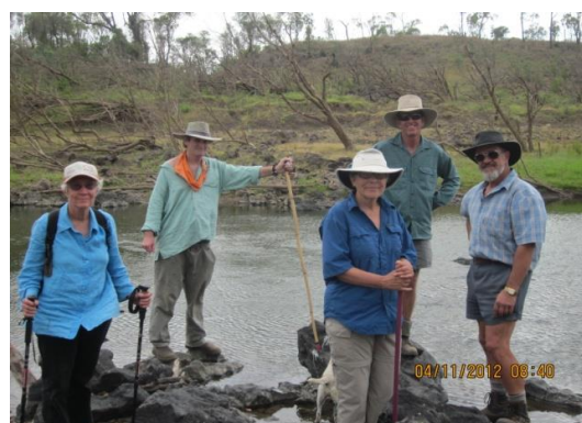
A happy group