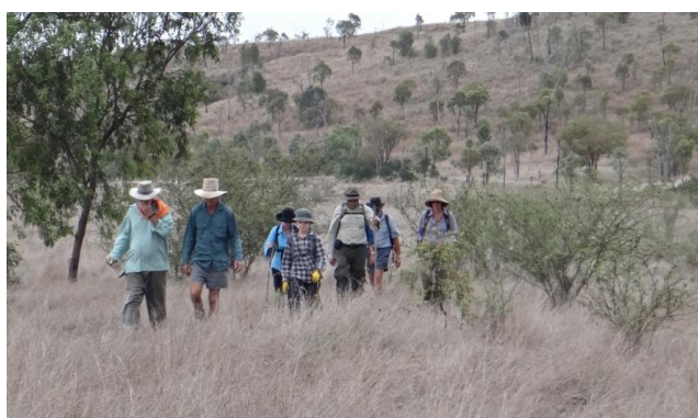
A relaxed walk

To complete a relaxing time, a beer and burger was enjoyed at the Westwood Hotel before everyone headed home. It was a steady yet enjoyable weekend for all and it was suggested it be made an annual event.