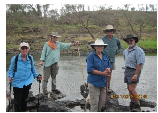
A happy group