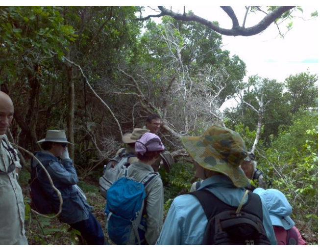
Looking out towards the Keppel Islands