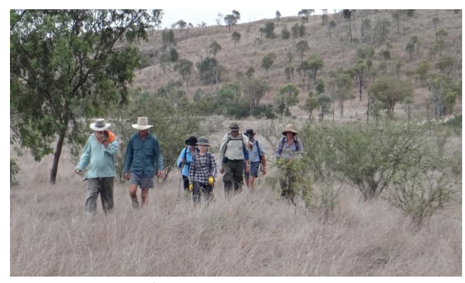
A relaxed walk

To complete a relaxing time, a beer and burger was enjoyed at the Westwood Hotel before everyone headed home. It was a steady yet enjoyable weekend for all and it was suggested it be made an annual event.